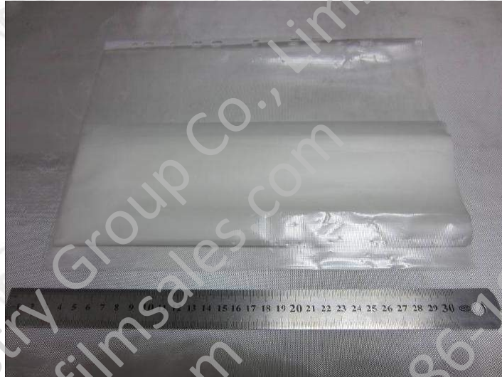
Photo of the sample